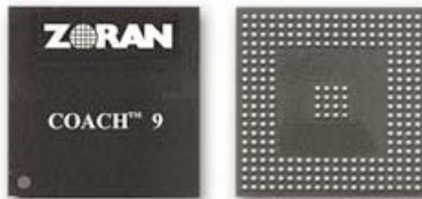
17cm x 17cm

For more information, contact Zoran's Sunnyvale office or the office nearest you: